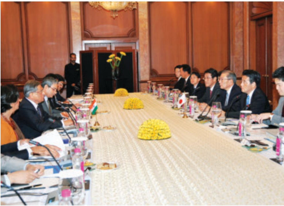
The 4th Japan-India Foreign Ministers' Strategic Dialogue held in New Delhi on August 21, 2010