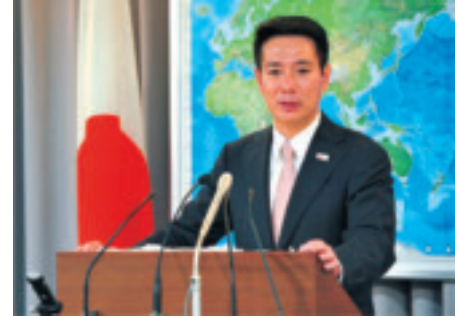
Foreign Minister, Mr. Seiji Maehara

Following his re-election as leader of the governing Democratic Party of Japan (DPJ), Japanese Prime Minister, Mr. Naoto Kan, announced a new Cabinet on 17 September 2010. In the reshuffled Cabinet, Mr. Seiji Maehara has taken over as the new Foreign Minister of Japan. Mr Maehara, former Transport Minister, replaced Mr. Katsuya Okada, who has been appointed as the Secretary General of the Democratic Party of Japan (DPJ).