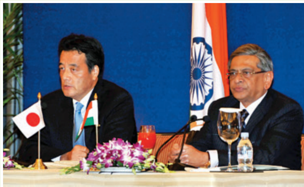
Mr. Katsuya Okada, Minister for Foreign Affairs of Japan (left), at a Joint Press Conference with Mr. S.M. Krishna, Minister of External Affairs of India, on August 21, 2010, in New Delhi.

☐ A quarterly newsletter from the Embassy of Japan, India ☐