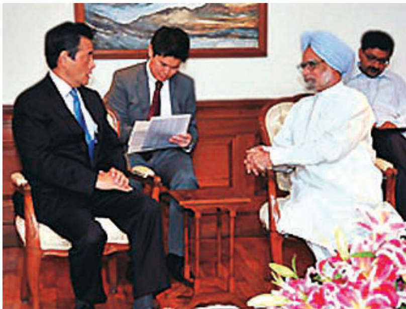
Japanese Foreign Minister, Mr. Katsuya Okada, paid a courtesy call on Dr. Manmohan Singh, Prime Minister of India