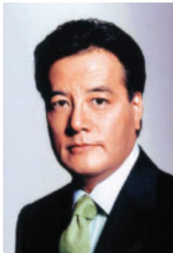
Katsuya Okada (Former) Minister for Foreign Affairs

The international community embarks on a new era of cooperation. Nevertheless, we face a wide range of global challenges which the international community needs to tackle collectively. These include nuclear disarmament and non-proliferation, climate change, piracy, terrorism, the recovery of the global economy and aid to developing countries. Now more than ever, Japan is called on to act proactively and to present initiatives, and thereby to respond to international expectations. As the world is becoming multipolar, one of Japan’s vital responsibilities is to actively engage itself in restructuring an international mechanism for formulating agreement. Furthermore, in order to play a meaningful role in the