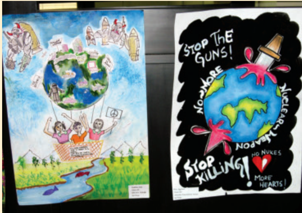
Two first-prize winning entries of the competition

Coinciding with the day of the atomic bombing of Nagasaki 65 years ago, a painting competition was organized for the school students of Delhi, at the Japan Foundation, New Delhi, on 9 August 2010. The competition, titled “ Quest for Peace ”, was organized by the National Integrated Forum of Artists and Activists (NIFAA) , in cooperation with the Embassy of Japan and the Japan Foundation. NIFAA, a leading socio-cultural organization of India, is dedicated to the cause of promoting universal brotherhood and world peace, and regularly organizes