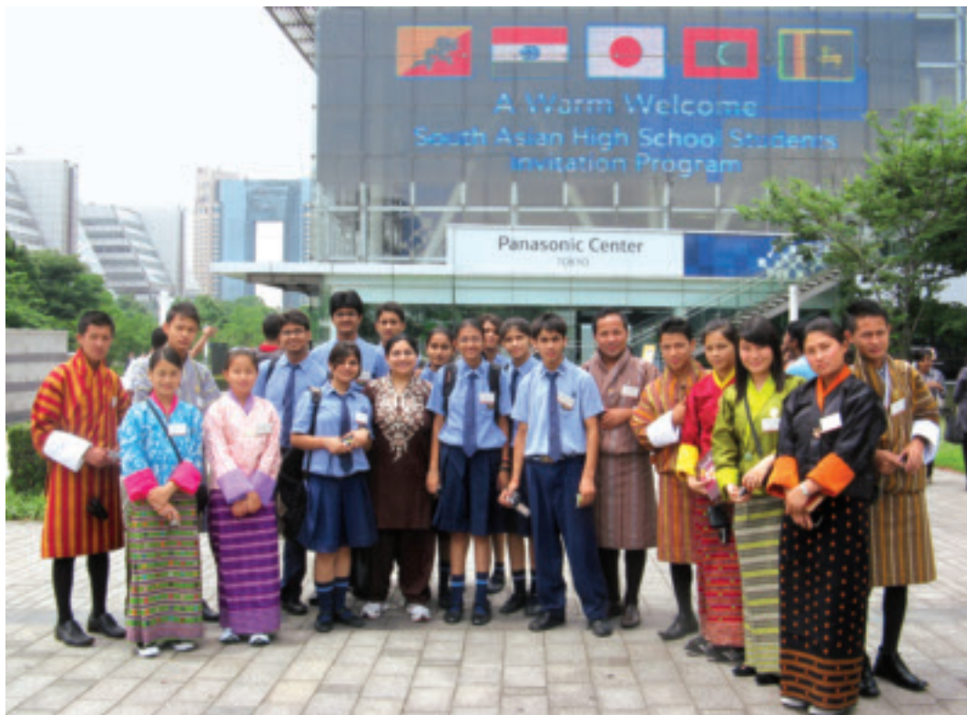
Indian and Bhutanese delegations at the Panasonic Center, Tokyo

A REPORT BY THE DELEGATION OF GANGA INTERNATIONAL SCHOOL, NEW DELHI, INDIA