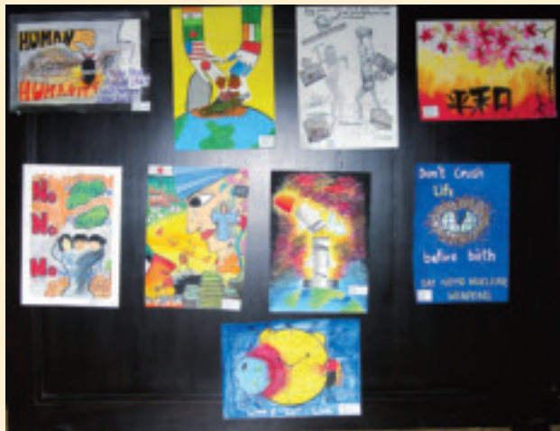
Consolation-prize winning entries

We have the pleasure to inform you about Japan Foundation’s free Japanese learning website https://www.erin.ne.jp/en/through which you can learn elementary Japanese. This website has been compiled based on the DVD teaching material, “ Erin’s Challenge! I Can Speak Japanese ”, for Japanese learners to study using the Internet. There are many visual images on this website. These pictures and videos help you with studying common Japanese expressions and learning about many aspects of Japanese culture. We are sure you will find it very interesting and useful.